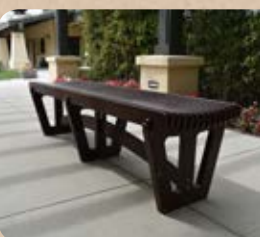
Prototype bench made of high-density polyethylene (HDPE) that the LARMAC Board approved.

The LARMAC Maintenance Department currently assigns one maintenance technician one day per week to prep and paint benches. By using low maintenance materials, we can focus maintenance resources on other areas of Ladera Ranch.