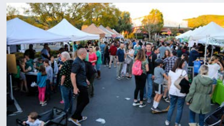
Ladera Rancho Chamber of Commerce Night Market Event

How can you support Ranch Night Market? Grab some bags and the family and get over to Mercantile West the second Friday of each month of course. See you there! ■